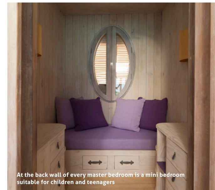
At the back wall of every master bedroom is a mini bedroom suitable for children and teenagers

Set within The Gathering, Soneva Spa's view of the shimmering lagoon sets the tone for soul therapy. Choose from a menu of holistic and traditional treatments conducted by highly skilled therapists using all natural products or indulge in one of the signature journeys. Spa treatments are complemented by the fully-equipped gym and yoga pavilion as well as sauna and steam rooms.