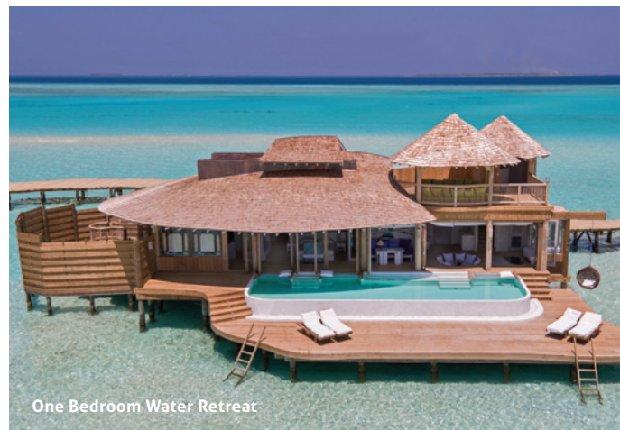
One Bedroom Water Retreat