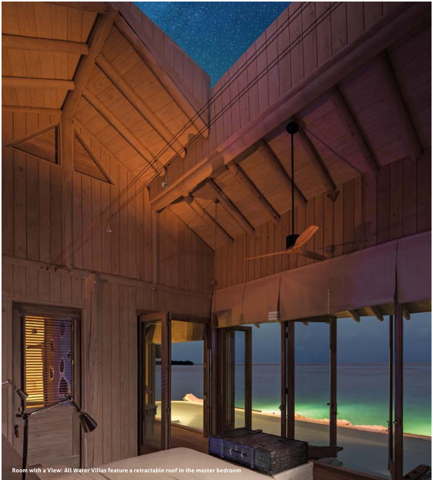
Room with a View: All Water Villas feature a retractable roof in the master bedroom

The resort is where the embrace of nature is enhanced by the caress of luxury. Guests will be treated to a unique 'castaway' experience within the spacious villas, which feature beautifully designed interiors made from the highest quality sustainable materials.