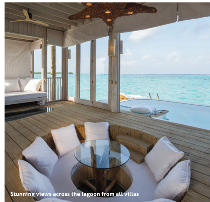
Stunning views across the lagoon from all villas