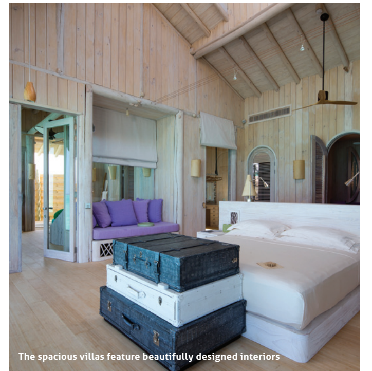
The spacious villas feature beautifully designed interiors

Tucked away on the secluded North Island, set in the lagoon close to the Water Villas is the perfect spot for swimming, snorkelling and time in the sun. Enjoy a delightful lunch on our private beach, prepared by the Chef using only what he can catch or pick.