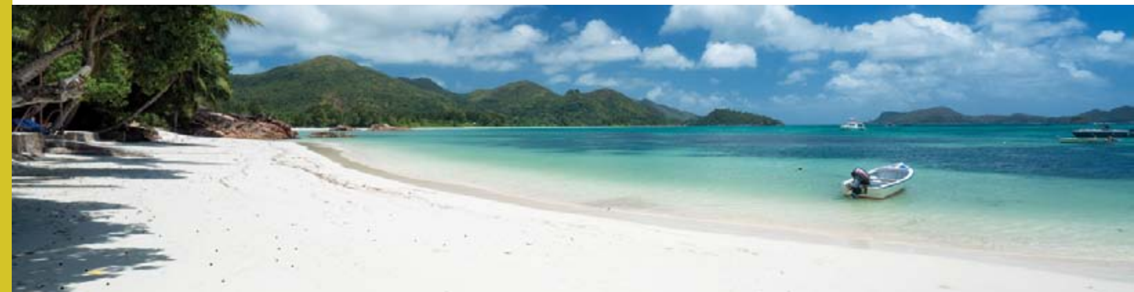
A private beach with a spectacular view