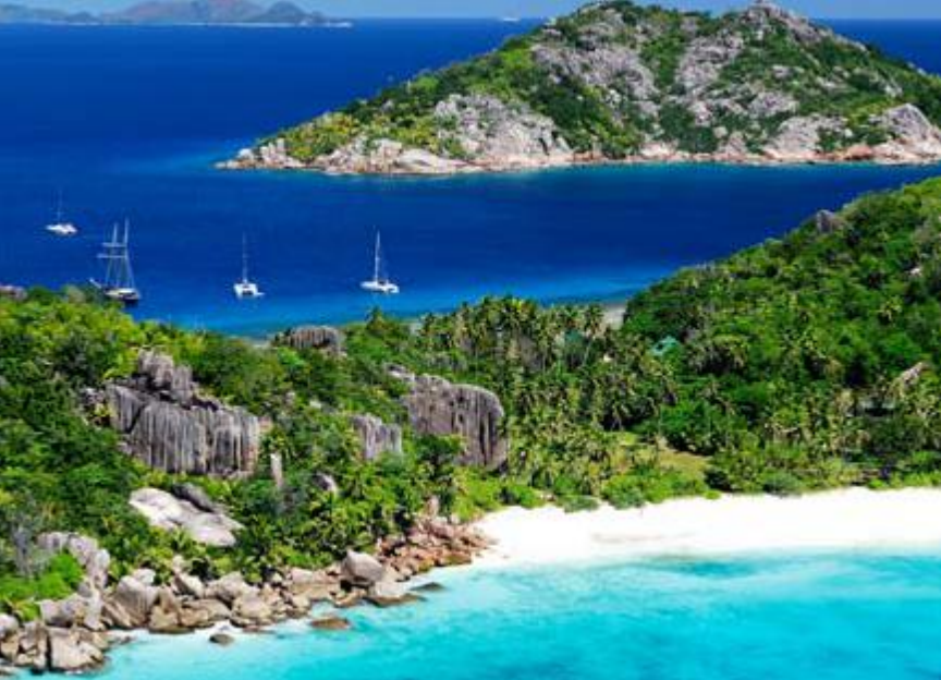
Top : Sister islands – bottom : Anse Lazio (Praslin)