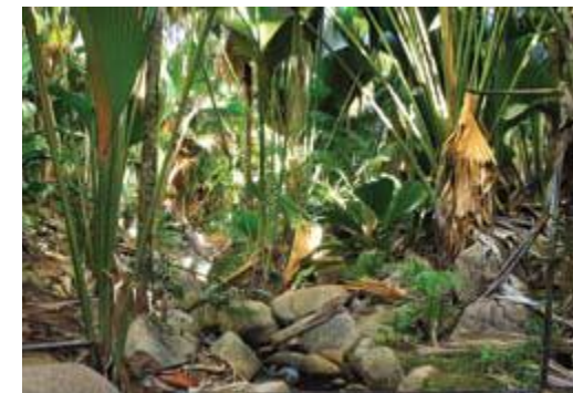
Bottom : Vallée de Mai (Praslin)