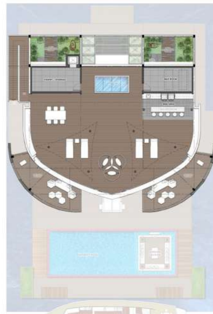
Roof deck plan