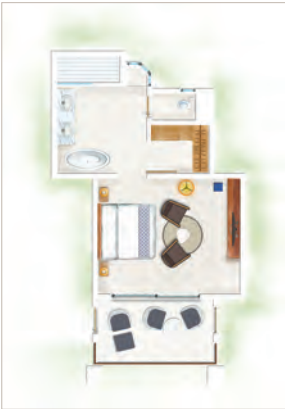
Paradis Bay View