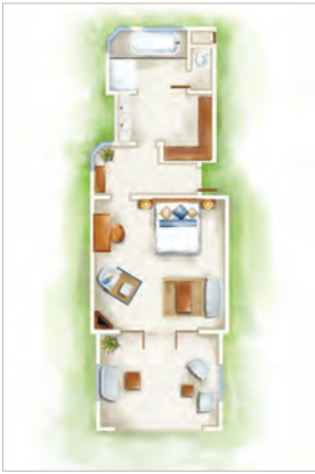
Junior Suite / Junior Suite Beachfront / 2-bedroom Family Suite Beachfront (interleading)