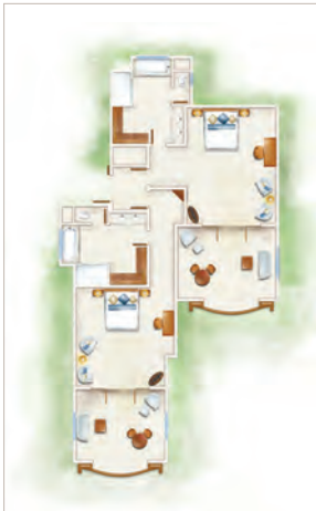
2-bedroom family suite