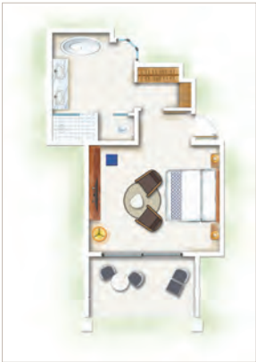
Paradis Beachfront / 2-bedroom Paradis Family Suite Beachfront (interleading)