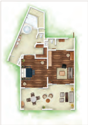
Senior Suite Beachfront