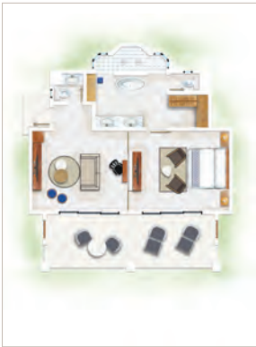
Paradis Suite Beachfront