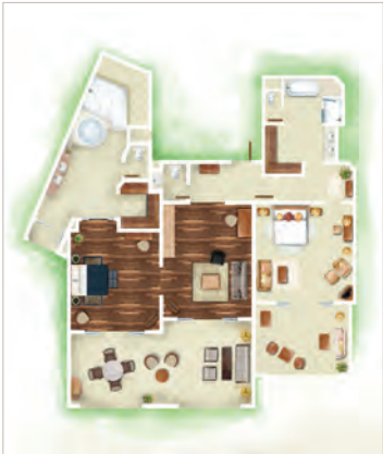
2-bedroom Senior Family Suite Beachfront