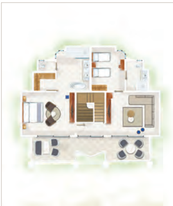
Paradis Luxury Family Suite Beachfront