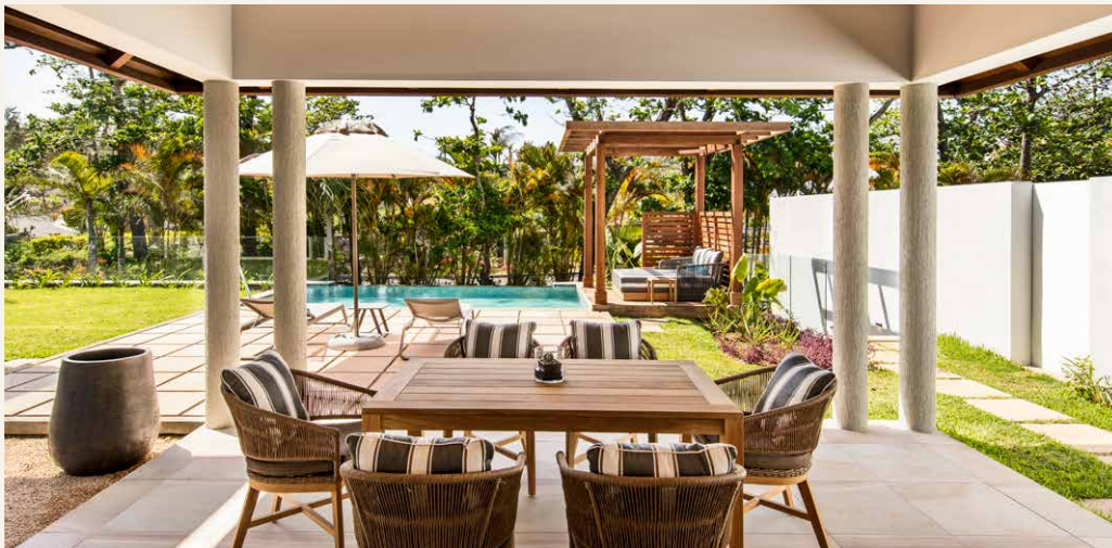
5 Pool Villa 4 Bedrooms – Maximum 12 people (8 adults + 4 children)

Set within lush gardens, this 395 m 2 villa welcomes you through a covered walkway to a generous patio with living and dining areas. The master bedroom opens directly onto the pool and terrace. Upstairs features a master king bedroom en suite with balcony overlooking the private pool, and a twin en suite bedroom. On the ground floor, your dining area is serviced by an in-villa kitchen, ideal for private dinners or barbecues.