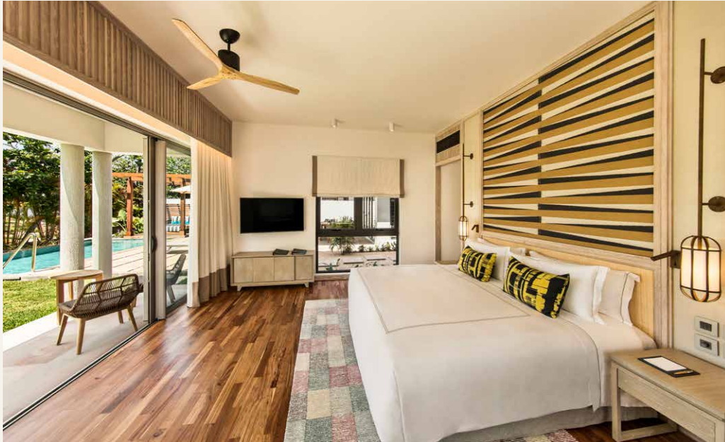
1 Pool Villa 2 Bedrooms – Maximum 6 people (4 adults + 2 children)

Your private tropical garden sanctuary for family and friends to experience Mauritius together. With 270 m 2 of exclusive living space, enjoy effortless shared time by the pool and around the table. Relax indoors in the lounge with music or a movie, then gather outdoors for a barbecue on your sundeck. Enjoy truly intuitive service from your Villa Host.