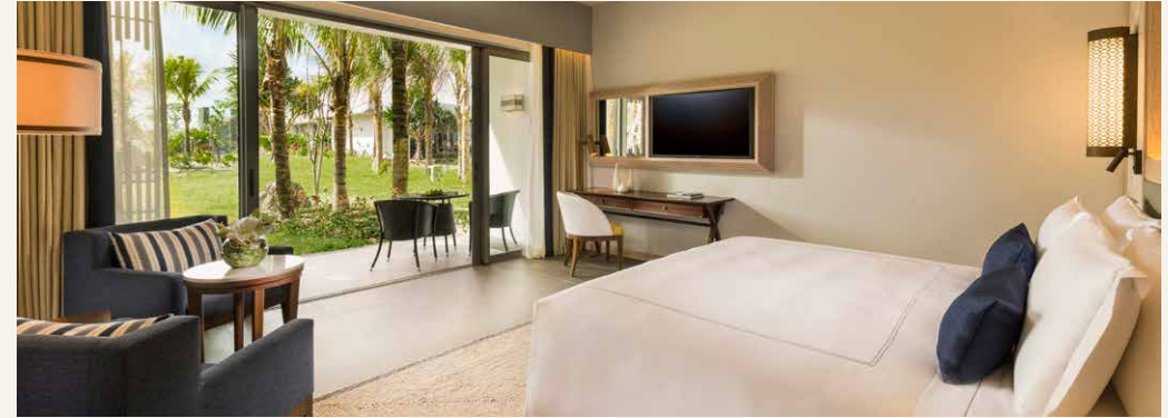
38 Deluxe Garden Room