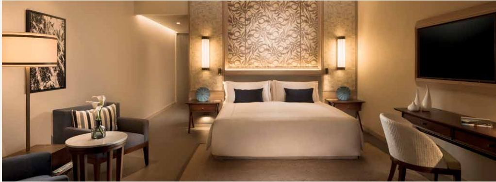
68 Prestige Garden Room

All rooms are designed for relaxed island living. Rooms are available in King or Twin configurations, with Twin Rooms interconnecting with King Rooms. All rooms feature a furnished terrace or balcony, air conditioning, bathroom with bathtub and rain shower, hairdryer, satellite TV channels, WI-FI, Smart TV with Chrome cast technology, telephone with voice mail, individual safe, desk, sitting area, minibar, tea and coffee making facilities, Lavazza espresso machine, 220-volt sockets, bathroom amenities, bathrobe and slippers, evening turndown service and 24h in-room dining.